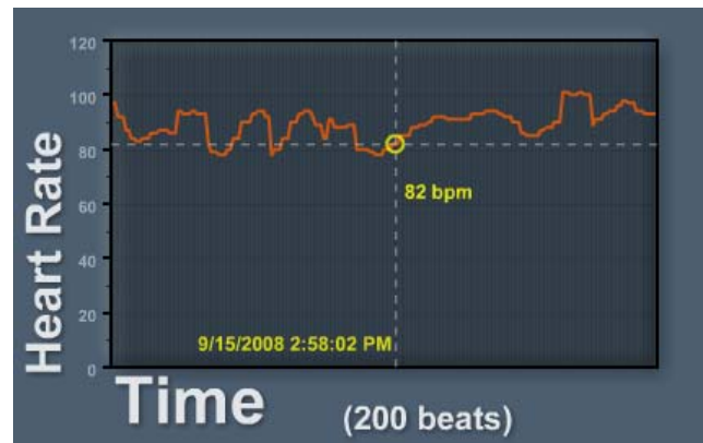
Figure 3 – The charts produced by the web portal facilitate a view of either an ECG signal or the heart rate variability over a period of beats.

that provides the link between the database and the web portal. The mobile device invokes a web service to push data through the Internet and into the database. The web portal invokes a web service to pull data from the database and generate an XML file for defining the graph. We use the XML/SWF library to generate the chart, an example of which is shown in Figure 3, and update it automatically. We make heavy use of the AJAX design paradigm to create a rich, interactive user experience.